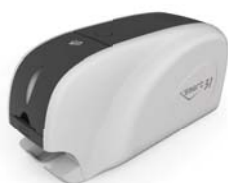
Single sided ID CARD PRINTER