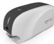
Rewritable ID CARD PRINTER