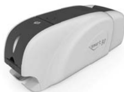
Dual sided ID CARD PRINTER